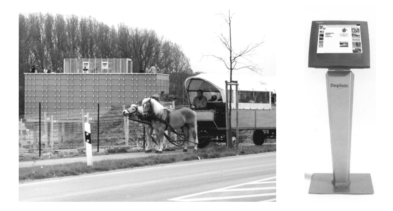
Figure 1: The "Green Box" (here in the background with people visiting the viewing platform) an information centre showing models, displays and computer visualizations. (left)

For frequently updating all computers are connected via a local Windows network using 10/100 Base T-Ethernet cards. Installation set up is possible by the CD-Rom drive of the host computer, which is a Compac PC. Canvas surface of the projection area is approx. 2 x 1.5 metre. This surface requires a wide-angle lens zoom projector. The canvas surface is limited due to the construction of the "Green Box".