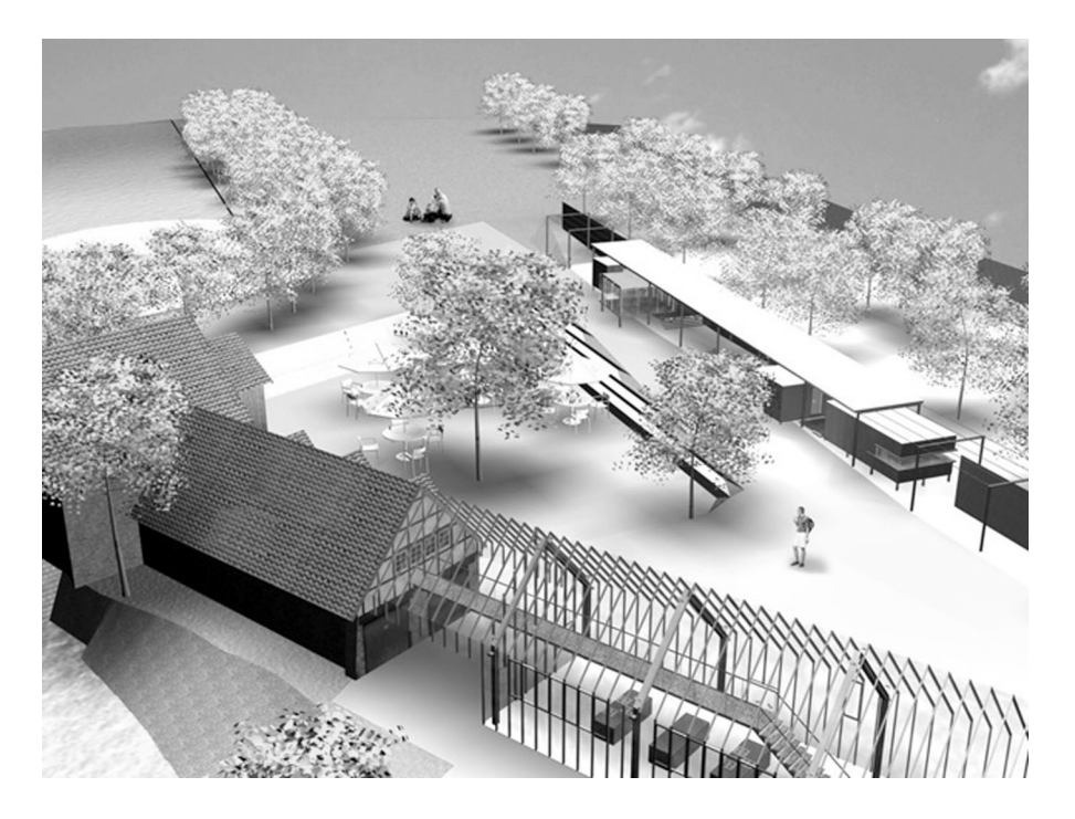
Figure 6: "Oelder Forum" major communication area of the exhibition, including a monument protected old water mill and a museum for children

The "Oelder Forum" is projected in the environment of an old water mill. This water mill named "Kramers Mühle" is monument protected by law. Beside this old building the entrance area, a coffee house and a museum for children is designed. The Oelder Forum should become a main communication area of the exhibition. Some scale giving elements like people or street furniture are added to the scene description.