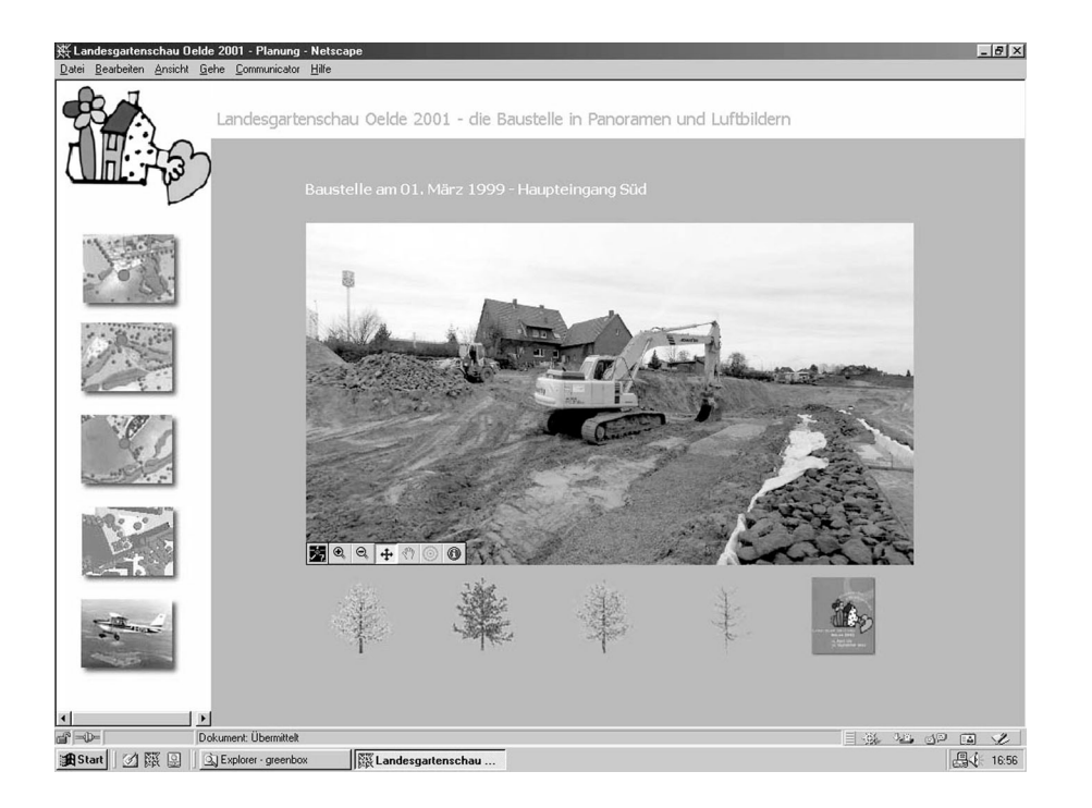
Figure 8: Screen shot displaying the panorama position menu, a selected panorama and the time axis by tree icons.