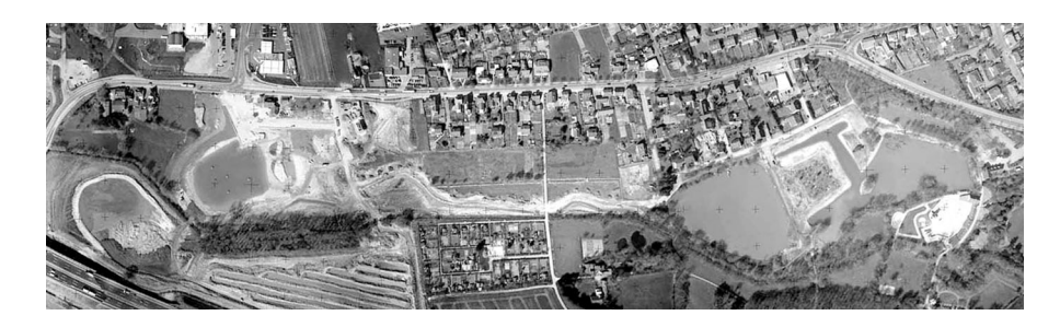
Figure 7: Digital orthophoto of the Southern part of the horticultural exhibition under construction. Pilot and navigator Franz-Josef Heimes.

Due to the high degree of automation of digital photogrammetry it is feasible to produce those orthophotos periodically. The orthophotos are displayed by selecting the season from a time axis in the user interface. Figure 6 displays the Southern part of the exhibition. The photo flight was done with LEO (Local Earth Observation) system developed by FH Bochum. The flight height is about 650 m. The equipment used is a Rolleiflex 6006 metric reseau camera with 80 mm focal length and a bulk-film magazine. The images are then digitised with 2000 ppi and automatically transformed into an orthophoto map with the aid of a Leica Helava System.